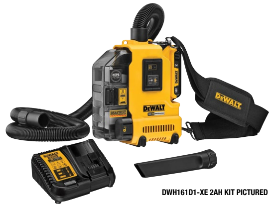
DWH161D1-XE 2AH KIT PICTURED