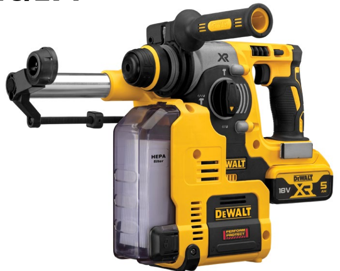
PICTURED WITH DCH273 (SOLD SEPARATELY)

Side Handle, Dust Extraction Head/Dust Brush