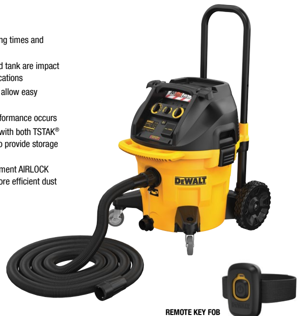
REMOTE KEY FOB