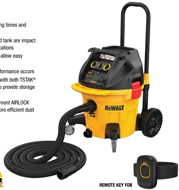
REMOTE KEY FOB