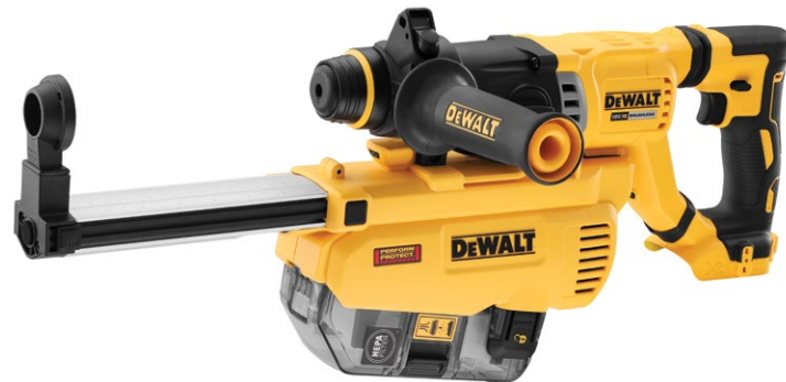
PICTURED WITH DCH263 (SOLD SEPARATELY)